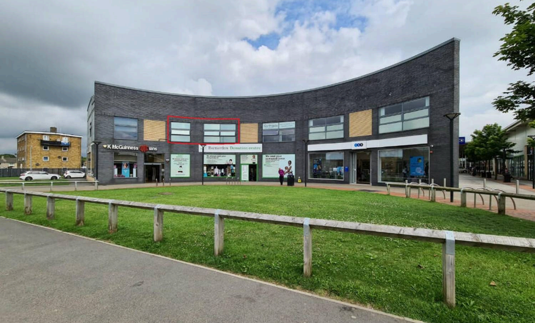
Avenue House, Greenwell Road, Newton Aycliffe County Durham